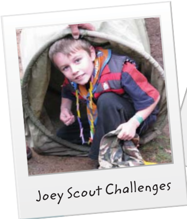
Joey Scout Challenges