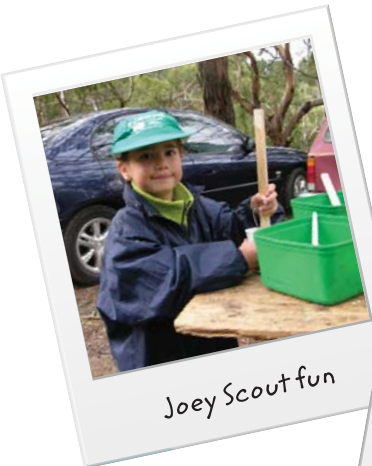
Joey Scout fun