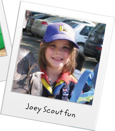
Joey Scout fun